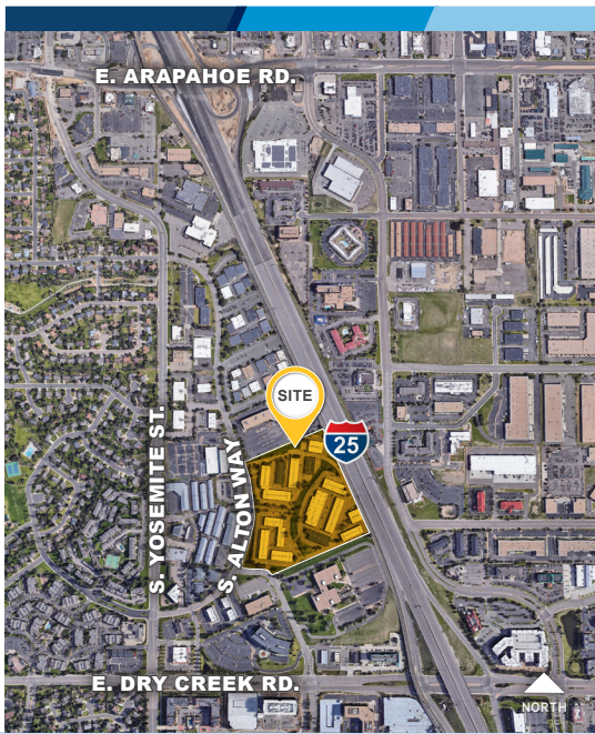
This document has been prepared by Colliers for advertising purposes only. The information contained herein has been obtained from sources we deem reliable. While we have no reason to doubt its accuracy, no warranty or representation is made of the foregoing information. Terms of sale or lease and availability are subject to change or withdrawal without notice.