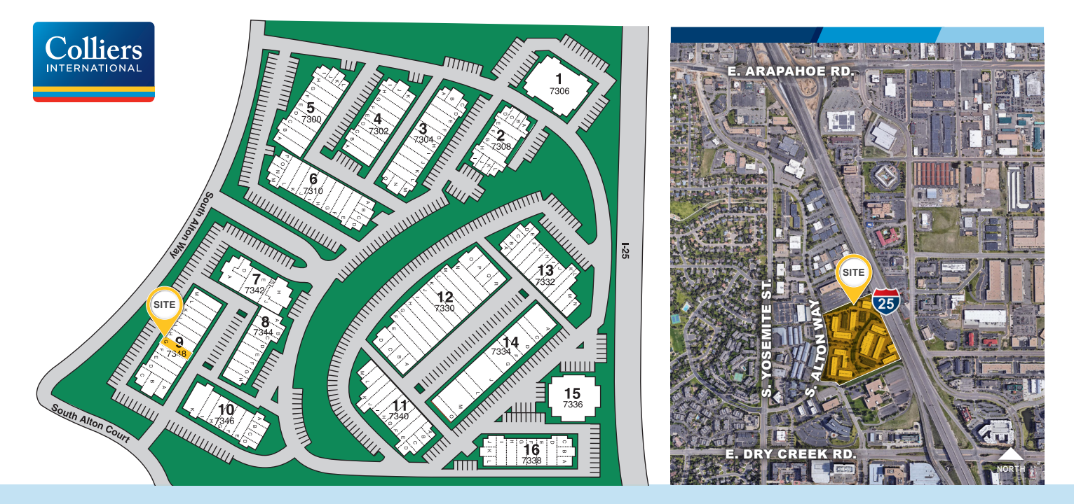
This document has been prepared by Colliers International for advertising purposes only. The information contained herein has been obtained from sources we deem reliable. While we have no reason to doubt its accuracy, no warranty or representation is made of the foregoing information. Terms of sale or lease and availability are subject to change or withdrawal without notice.