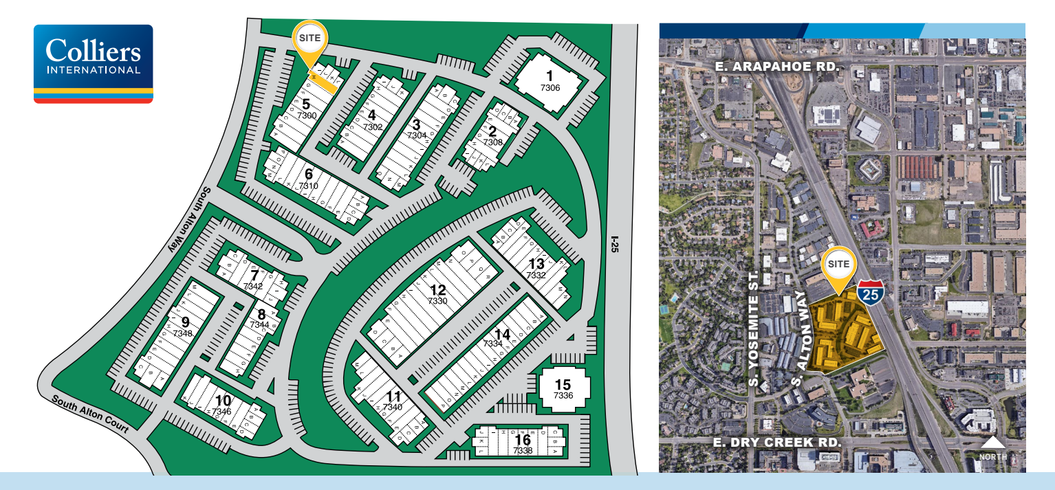
This document has been prepared by Colliers International for advertising purposes only. The information contained herein has been obtained from sources we deem reliable. While we have no reason to doubt its accuracy, no warranty or representation is made of the foregoing information. Terms of sale or lease and availability are subject to change or withdrawal without notice.