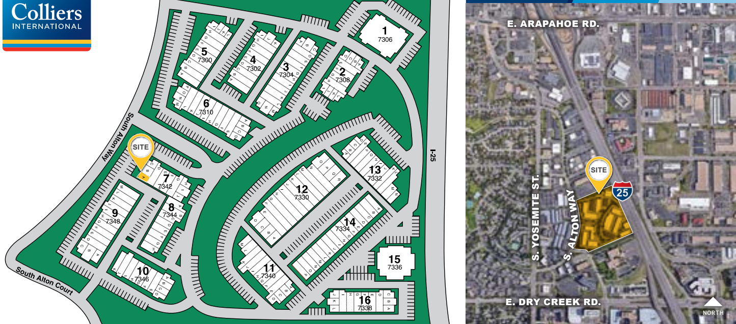
This document has been prepared by Colliers International for advertising purposes only. The information contained herein has been obtained from sources we deem reliable. While we have no reason to doubt its accuracy, no warranty or representation is made of the foregoing information. Terms of sale or lease and availability are subject to change or withdrawal without notice.